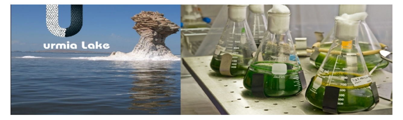
Fig. 1. Dunaliella, with high lycopene and beta-carotene concentrations, isolated from uremia- the second salty lake of world (containing above 300 grams per litre salt)- located in the north-west of Iran (Isolation by Abolfazl Barzegari).

Carotenoids are chemicals with high commercial demand that are used as coloring agents in neutraceuticals, pharmaceuticals, cosmetics and food. On account of their antioxidant properties, these materials have been considered as potential agents in chemoprevention of cancers (Leach, et al. , 1993), aging and free radicals effects.